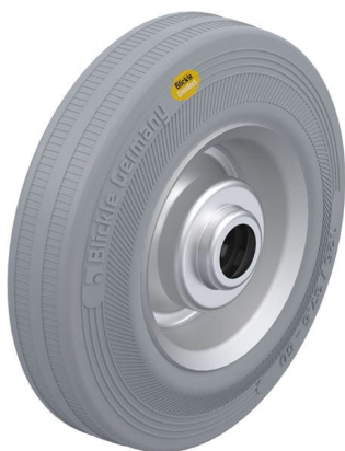
Wheel used RD 125/15R-VLI