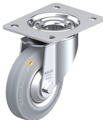
Corresponding swivel caster LK-RD 125R-3-VLI-FA