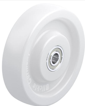
Wheel used SPO 200/20K