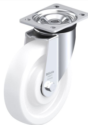
Corresponding swivel caster LK-SP0 200K