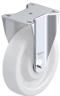
Corresponding rigid caster BH-SP0 200K