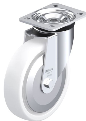
Corresponding swivel caster LK-SP0 201G-FA