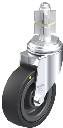
Corresponding swivel caster LKRA-VPA 101K-11-EL-E15