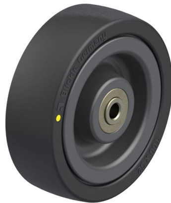
Wheel used VPA 101/8K-EL