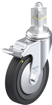
Corresponding standard locking LKRA-VPA 125K-11-FI-EL-FA-E15