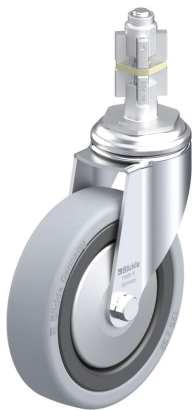
Corresponding swivel caster LKRA-VPA 126G-11-FA-E14