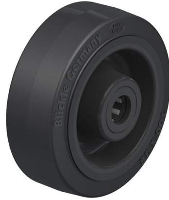
Wheel used POEV 100/15R