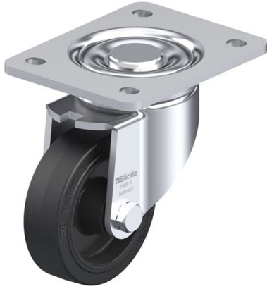
Corresponding swivel caster LH-POEV 100R-3