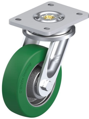
Corresponding swivel caster LO-GST 150K