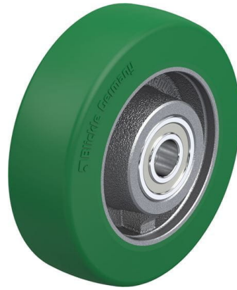
Wheel used GST 150/20K