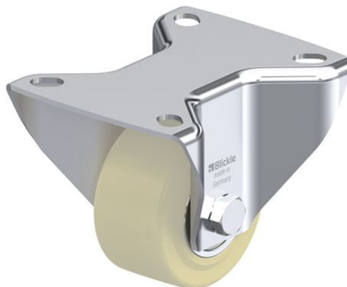
Corresponding rigid caster B-GSP0 60K