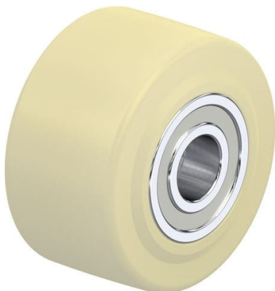
Wheel used GSP0 60/15K