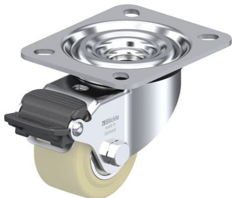
Corresponding standard locking L-GSP0 60K-RA