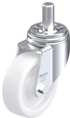
Corresponding swivel caster LHZ-SP0 150G