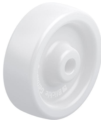
Wheel used SP0 150/20G