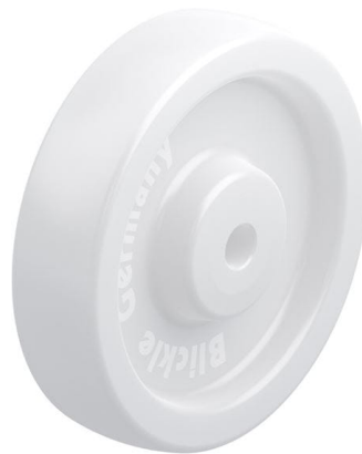
Wheel used SPO 200/20G