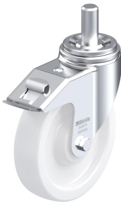
Corresponding standard locking LHZ-SPO 200G-FI