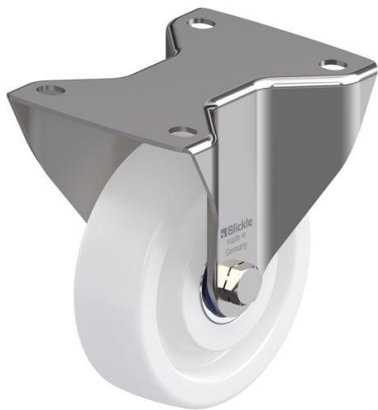
Corresponding rigid caster BKX-SP0 125XK-3