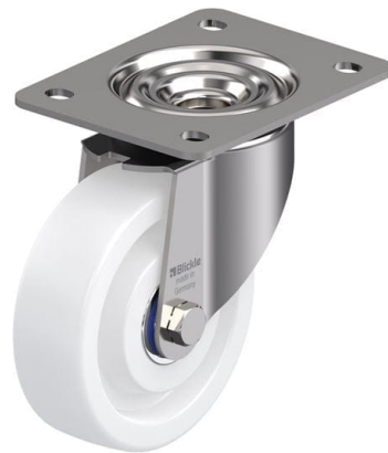
Corresponding swivel caster LKX-SP0 125XK-3