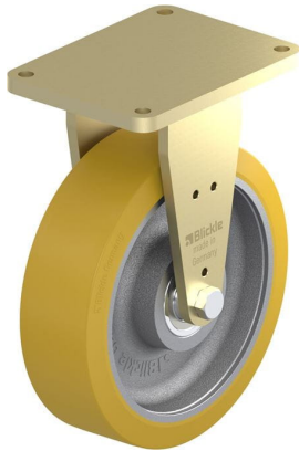
Corresponding rigid caster BS-GTH 504K