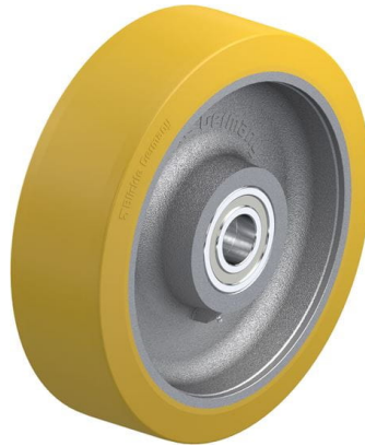
Wheel used GTH 504/60K