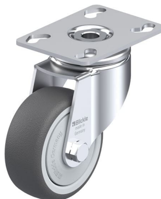
Corresponding swivel caster LKPA-PATH 80KF