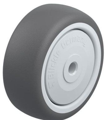
Wheel used PATH 80/8KF