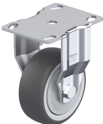
Corresponding rigid caster BKPA-PATH 80KF