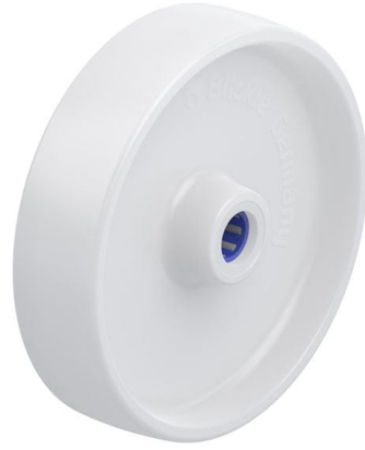
Wheel used PO 200/20XR