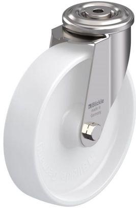
Corresponding swivel caster LEXR-PO 200XR