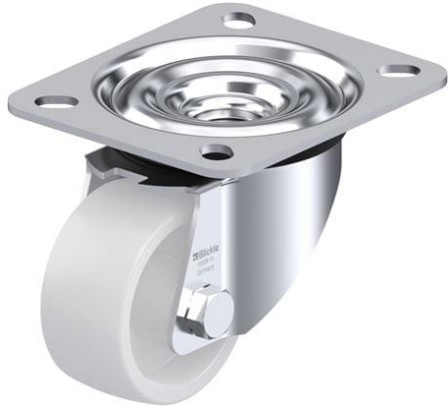
Corresponding swivel caster LE-PO 60G