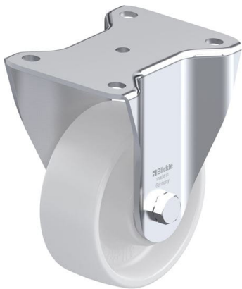
Corresponding rigid caster BH-PO 127K