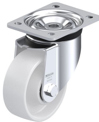
Corresponding swivel caster LK-PO 127K