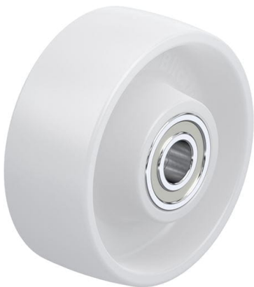
Wheel used PO 127/20K