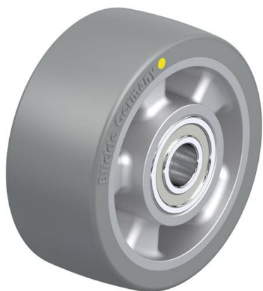
Wheel used ALTH 127/20K-AS