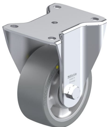
Corresponding rigid caster BH-ALTH 127K-AS