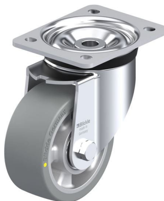
Corresponding swivel caster LK-ALTH 127K-AS