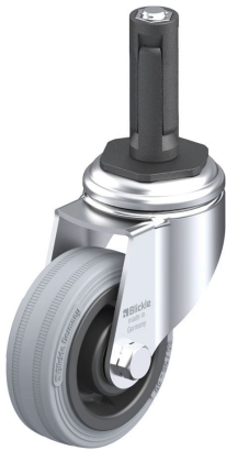
Corresponding swivel caster LKRA-VPA 80K-11-ER12