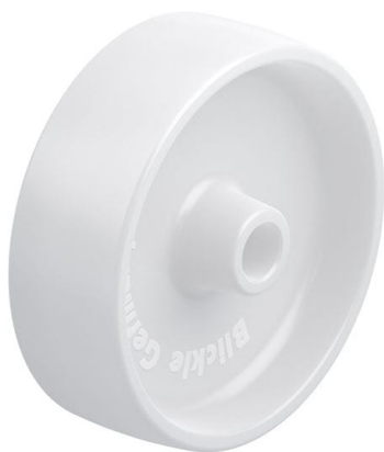
Wheel used PPN 150/20G