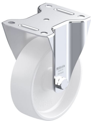
Corresponding rigid caster B-PPN 150G