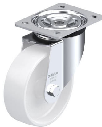
Corresponding swivel caster L-PPN 150G