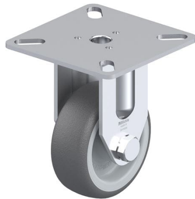
Corresponding rigid caster BPA-PATH 5G