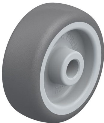
Wheel used PATH 50/8G