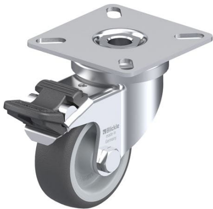
Corresponding standard locking LPA-PATH 5G-FI