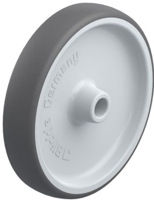
Wheel used PATH 200/20G