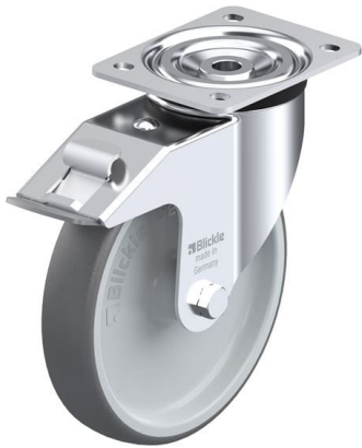
Corresponding standard locking L-PATH 200G-FI