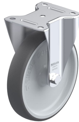
Corresponding rigid caster B-PATH 200G