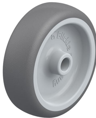
Wheel used PATH 101/12G