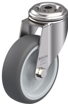
Corresponding swivel caster LKRXA-PATH 101G-11