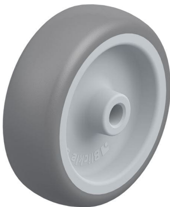
Wheel used TPA 75/8G