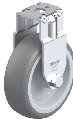
Corresponding rigid caster BRA-TPA 75G