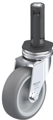
Corresponding standard locking LRA-TPA 75G-ER02