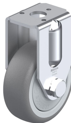
Corresponding rigid caster BRA-TPA 50KF