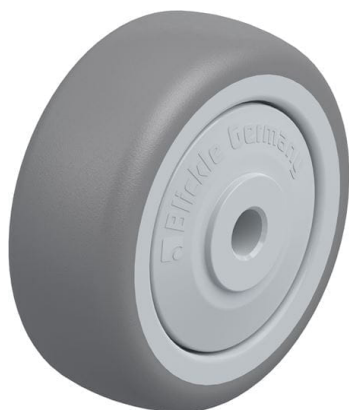
Wheel used TPA 50/6KF