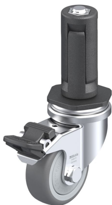
Corresponding standard locking LRA-TPA 50KF-FI-ER03