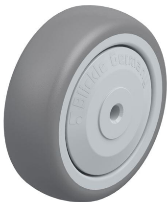
Wheel used TPA 75/6KF