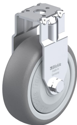
Corresponding rigid caster BRA-TPA 75KF