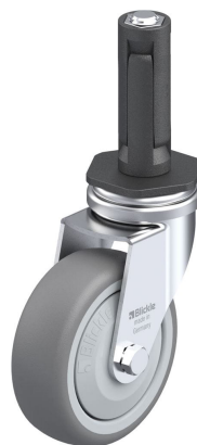
Corresponding swivel caster LRA-TPA 75KF-ER02