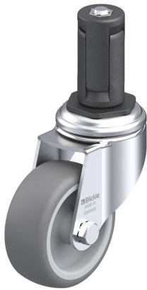
Corresponding swivel caster LKRA-TPA 80G-11-ER14