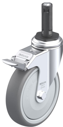
Corresponding standard locking LKRA-TPA 126KF-11-FI-ER12