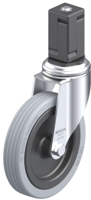
Corresponding swivel caster LKRA-VPA 125G-11-EV17