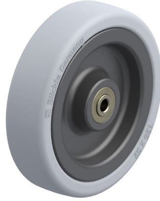
Wheel used VPA 126/8K