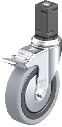
Corresponding standard locking LKRA-VPA 126K-11- FI-FA-EV17