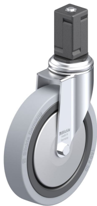
Corresponding swivel caster LKRA-VPA 150K-11-FA-EV17