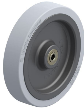
Wheel used VPA 150/8K