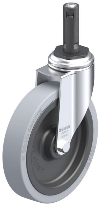
Corresponding swivel caster LKRA-VPA 150K-11-ER12