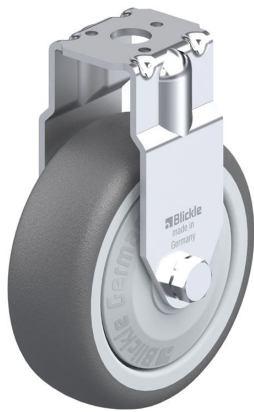
Corresponding rigid caster BRA-PATH 75KF