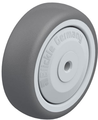
Wheel used PATH 75/6KF