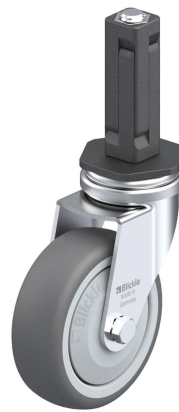
Corresponding swivel caster LRA-PATH 75KF-EV02