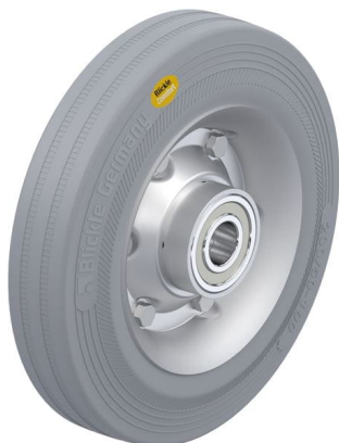
Wheel used RD 200/20K-VLI