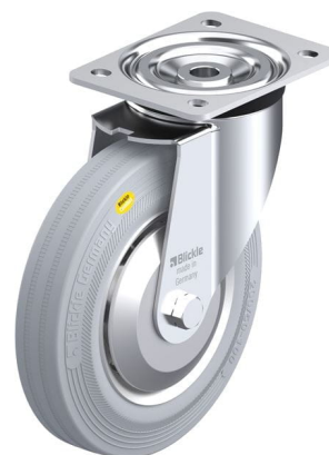
Corresponding swivel caster L-RD 200K-VLI-FA