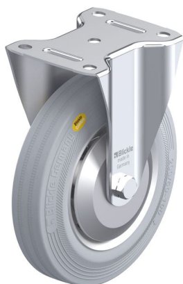
Corresponding rigid caster B-RD 200K-VLI-FA