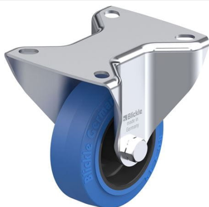
Corresponding rigid caster B-POEV 80G-SB