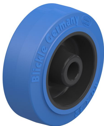
Wheel used POEV 80/12G-SB