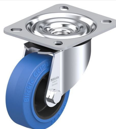
Corresponding swivel caster L-POEV 80G-SB