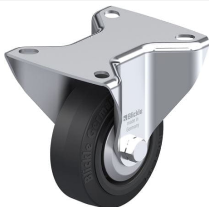
Corresponding rigid caster B-POEV 80XR-FA