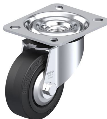
Corresponding swivel caster L-POEV 80XR-FA