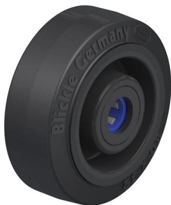
Wheel used POEV 80/12XR