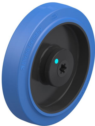
Wheel used POEV 200/12KAD-SB