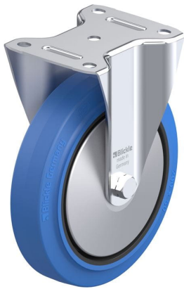
Corresponding rigid caster B-POEV 200KAD-SB-FA