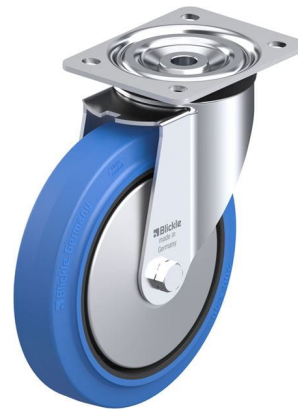
Corresponding swivel caster L-POEV 200KAD-SB-FA