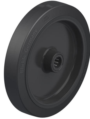
Wheel used POEV 250/25R