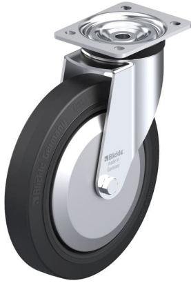
Corresponding swivel caster L-POEV 250R-3-FA