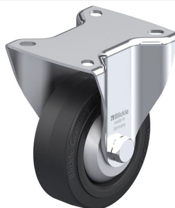
Corresponding rigid caster BK-POEV 100XR-1-FA