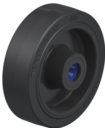
Wheel used POEV 100/15XR