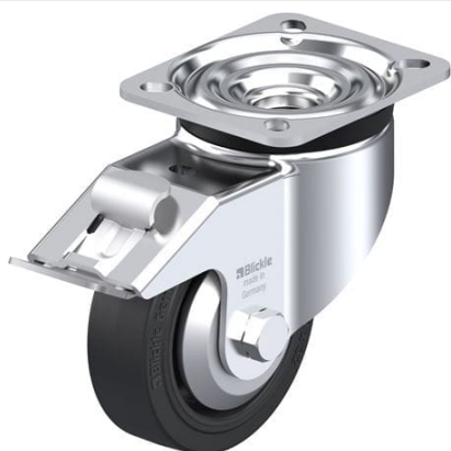
Corresponding standard locking LK-POEV 100XR-1-FI-FA