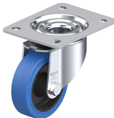
Corresponding swivel caster LK-POEV 100XR-3-SB