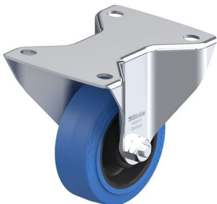
Corresponding rigid caster BK-POEV 100XR-3-SB