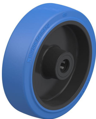
Wheel used POEV 125/15R-SB