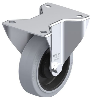
Corresponding rigid caster BK-POEV 125KA-3-SG