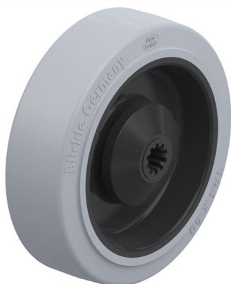
Wheel used POEV 125/10KA-SG