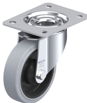
Corresponding swivel caster LK-POEV 125KA-3-SG