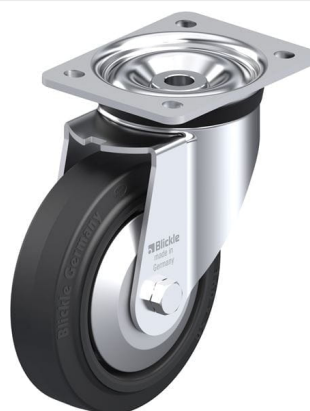
Corresponding swivel caster LK-POEV 160XR-FA