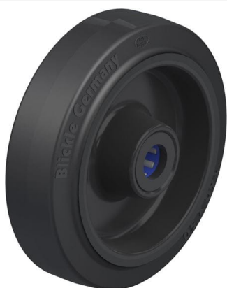
Wheel used POEV 160/20XR