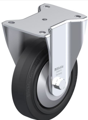
Corresponding rigid caster BH-POEV 160XR-FA