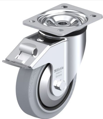
Corresponding standard locking LK-POEV 160XR-FI-SG-FA