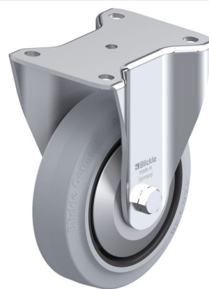
Corresponding rigid caster BH-POEV 160XR-SG-FA