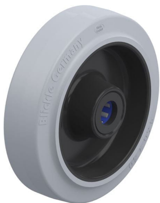
Wheel used POEV 160/20XR-SG