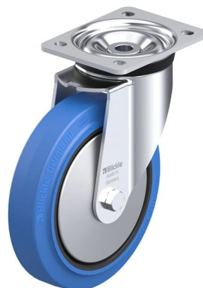
Corresponding swivel caster LK-POEV 200XR-SB-FA