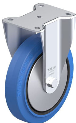
Corresponding rigid caster BH-POEV 200XR-SB-FA