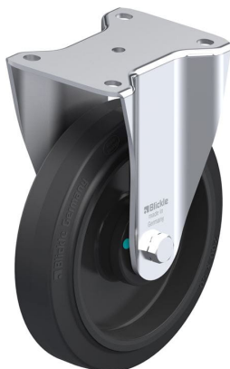
Corresponding rigid caster BH-POEV 200KAD