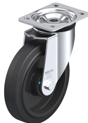
Corresponding swivel caster LK-POEV 200KAD