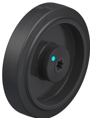
Wheel used POEV 200/12KAD