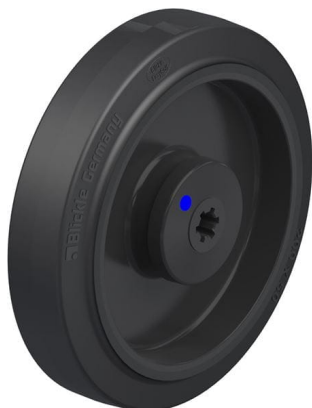
Wheel used POEV 200/12XKA