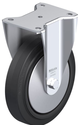
Corresponding rigid caster BH-POEV 200XKA-FA