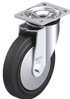
Corresponding swivel caster LK-POEV 200XKA-FA