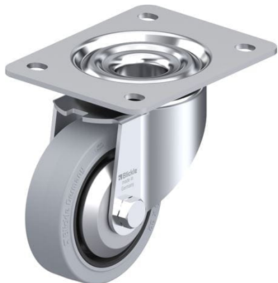
Corresponding swivel caster LK-POEV 100XR-3-SG-FA