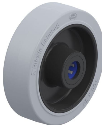
Wheel used POEV 100/15XR-SG