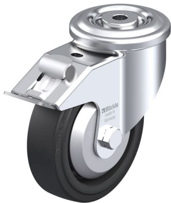
Corresponding standard locking LKR-POEV 125XR- FI-FA