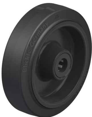
Wheel used POEV 160/20R